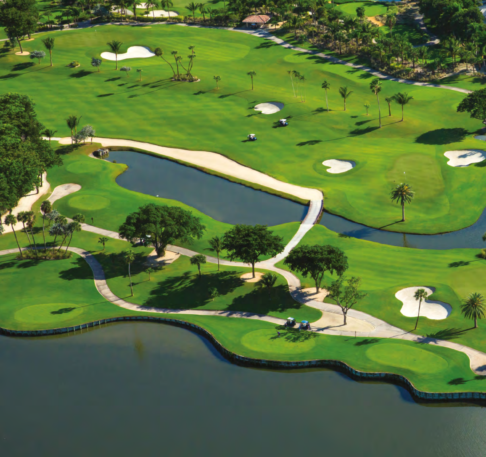
Turnberry Isle Resort and Golf Club